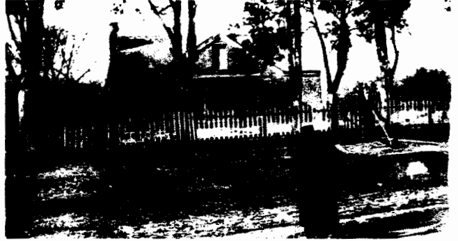
The Roderick Warfield house once stood at 420 N. Mulberry Street, east of town.

Also found with the recorded plat is a description of the boundaries that mentions land owners, alleys, creeks, the railroad, and even a gate on Slack's land where the pike turns.