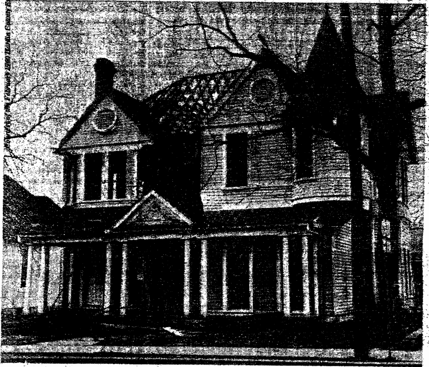
—Enterprise photo by Leon Blakey

Copyright 1967 by The Enterprise, Inc. All Rights Reserved. Enterprise