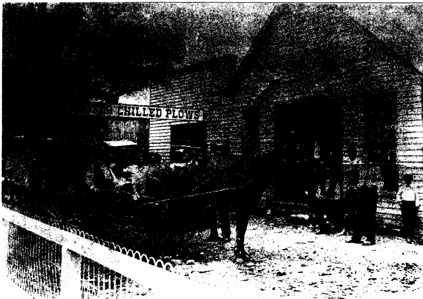
A.G. Lewis and Son farm supply store in Glendale. This photo, showing the front of the business that faced the L&N Railroad, is thought to have been taken around 1900. The building today houses the Glendale Antique Mall and sports a tall flat facade rising from a long covered porch.